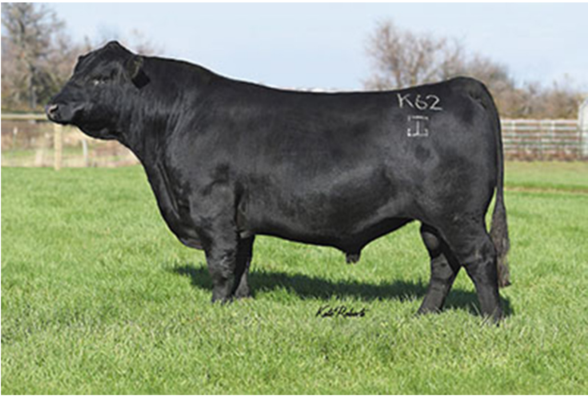
GAR SURE FIRE